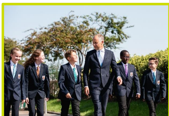
Inspiring lives through learning

We are looking to appoint a cleaning assistant to join our cleaning team. As cleaning assistant, you will provide an efficient and timely cleaning service across the school.